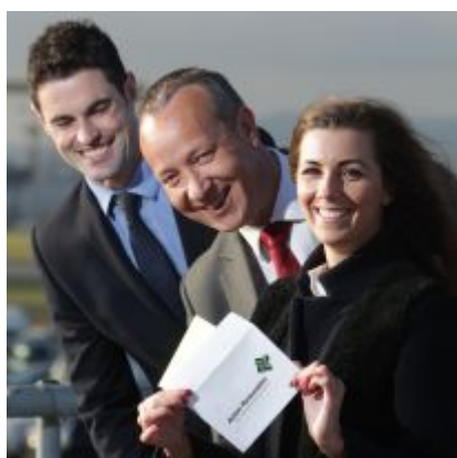
Action Renewables announce the shortlisted local businesses and organisations for this year's awards

Genetic selection for milk production in dairy cows over the last few decades has resulted in higher milk yields. As a result, within days of calving it is common for dairy cows to produce ten times more milk than the calf needs ..... Full story here