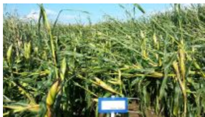
Almost every plant in this variety has brackled while surrounding plants remain upright

A DARD funded research project recently completed by the Agri-Food and Biosciences Institute (AFBI) has reported for the first time the activity of different wildlife species at night in farmyards in Northern Ireland ..... Full story here