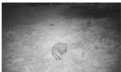
Badger foraging in a farmyard