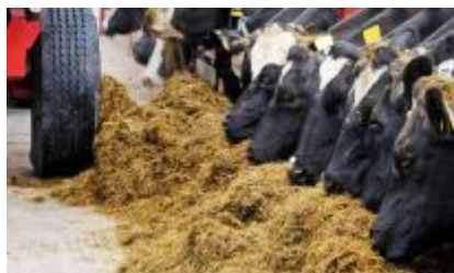
Cows were offered concentrates either as part of a Total mixed-ration (using a mixer wagon) or on a 'Feed-to-yield' basis using an out-of-parlour feeder

The recently published Cereal Recommended List for Northern Ireland 2015 provides a comprehensive guide to varieties best suited for use within Northern Ireland and is based on data collected from the extensive variety evaluation programmes carried out by AFBI Crossnacreevy ..... Full story here