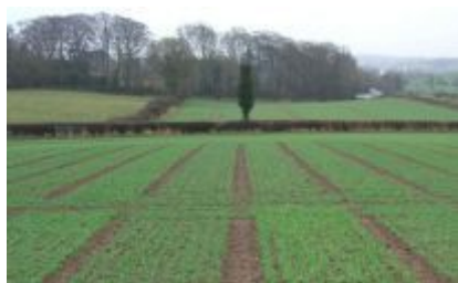
Cereal variety trial