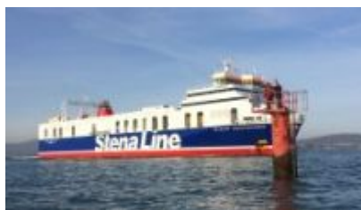
The new weather and sea data station being upgraded in Belfast Lough