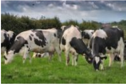
Dairy cows at AFBI Hillsborough