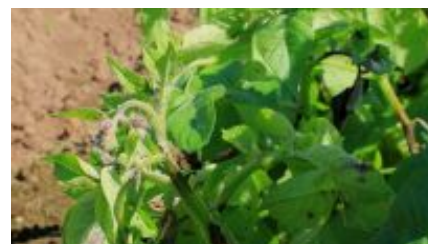
Potato blight on cv. Up-to-date showing the pathogen (Phytophthora infestans) sporulating on the underside of a leaf