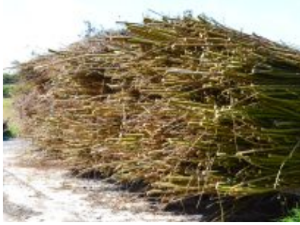
Harvested whole willow stems stacked for drying with waterproof cover fitted