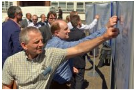
Workshop participants vote to prioritise areas discussed at the scoping workshop

In Northern Ireland, the Department of Enterprise, Trade and Investment (DETI) have set a number of important renewable energy targets, including 10% heat from renewable sources by 2020 ..... Full story here