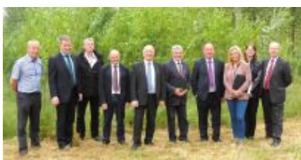
The ARD Committee pictured with AFBI staff during their recent visit to AFBI Loughgall