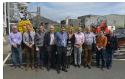
The group from the Lough Neagh Fishermen's Co-operative Society (LNFCS) who recently visited AFBI facilities

Scientists at AFBI Hillsborough recently organized a highly successful scoping workshop in the area of 'Precision Technology' ..... Full story here