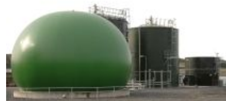
A recent visit by the International Energy Agency (IEA) to AFBI Hillsborough included a visit to AFBI's anaerobic digester