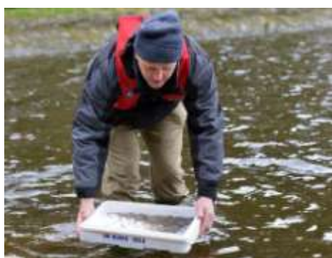
Glass eels introduced into Hillsborough Lake