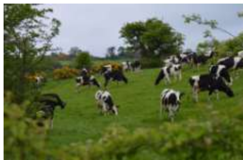
Dairy cows grazing at AFBI Hillsborough

Controlling milk production costs is essential to ensure the long term competitiveness of our dairy industry. With this in mind, the Agri-Food and Biosciences Institute (AFBI) at Hillsborough have recently completed a three-year study which examined the performance of spring calving dairy cows managed on different levels of concentrate feeding. Key outcomes of this study, which was co-funded by DARD and AgriSearch... find out more