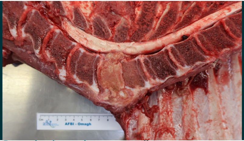
FIGURE 2: Osteomyelitis of the seventh cervical vertebra associated with Salmonella Dublin infection in a calf