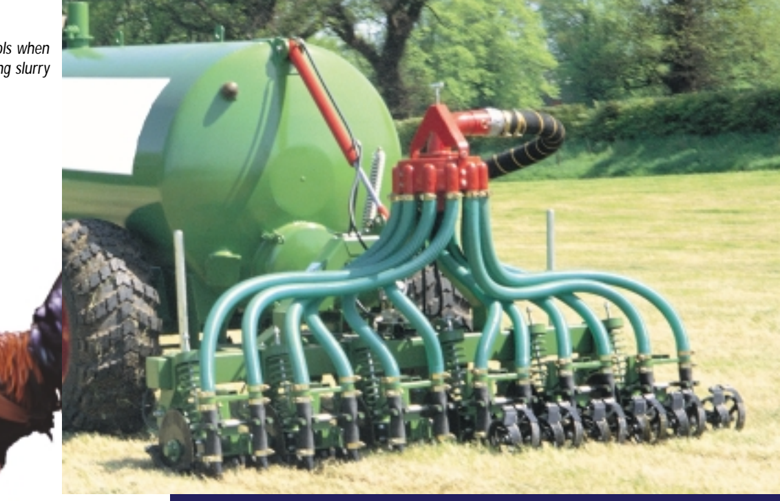
Avoid aerosols when spraying slurry

Further information is contained in the Code of Good Agricultural Practice for the Prevention of Pollution of Water , and the Code of Good Agricultural Practice for the Prevention of Pollution of Soil and Air . Information and advice can be obtained from Countryside Management Branch (see Annex 5 for contact details), and copies can be obtained from the DARD Internet site www.dardni.gov.uk/core/dard0444.htm.