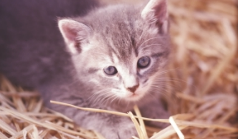
Be aware of the disease risks