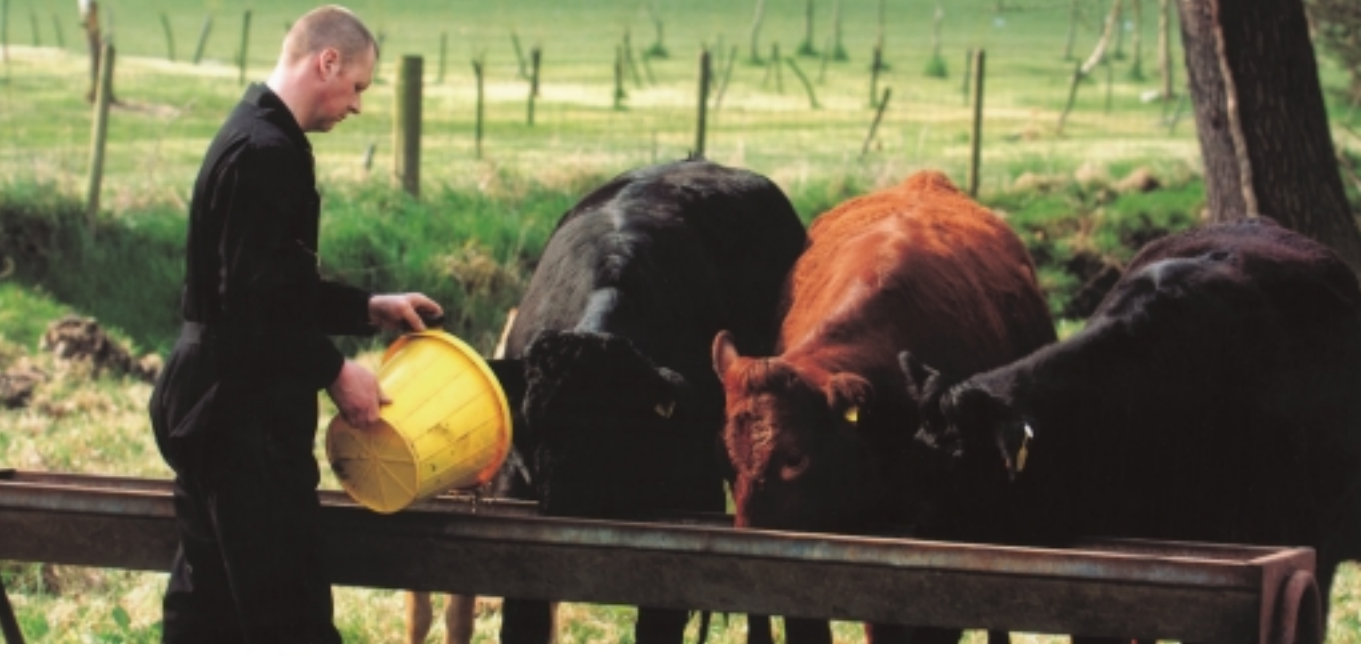
Raise troughs and reduce contamination