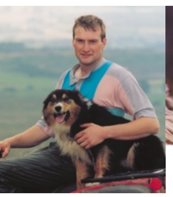
Man's best friend be aware of the disease risks

Dogs and cats should not be fed household scraps as foot and mouth outbreaks have been attributed to improper disposal of waste meat products.