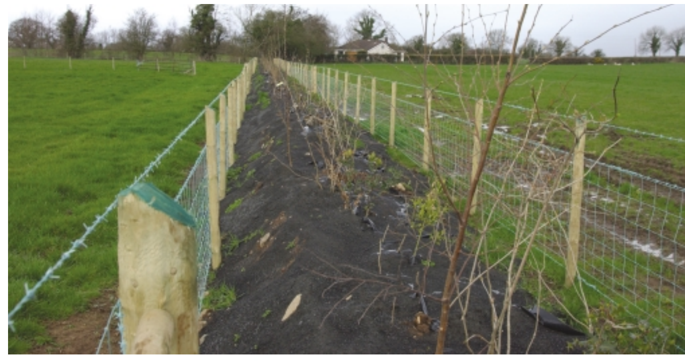
Keep your stock separate from your neighbours' stock

• Similarly where common grazing is used, livestock should be isolated for 21 days upon return.