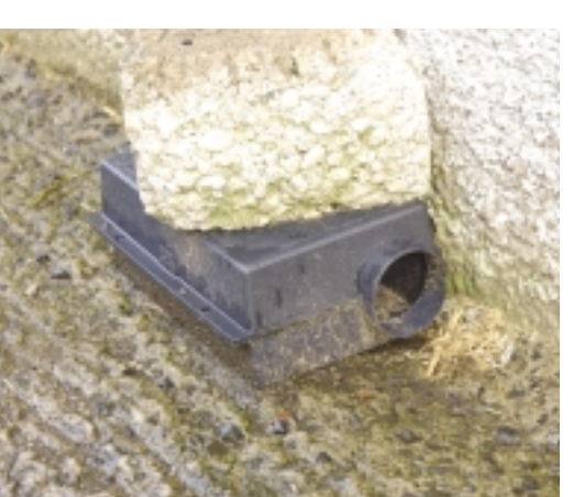
Keep vermin under control